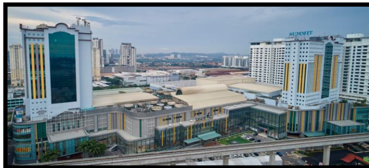
The Summit Subang USJ