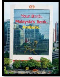
Bangunan AmBank Group