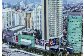
3 Damansara (formerly Tropicana City Mall) & Tropicana City Office Tower, Petaling Jaya