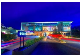
The Mines, Seri Kembangan