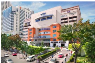
Gurney Plaza, Penang