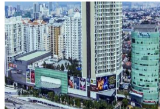
3 Damansara (formerly Tropicana City Mall) & Tropicana City Office Tower, Petaling Jaya