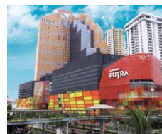
Sunway Putra Hotel