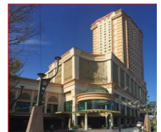
Sunway Clio Property