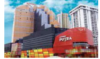
Sunway Putra Mall