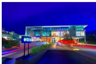
The Mines, Seri Kembangan