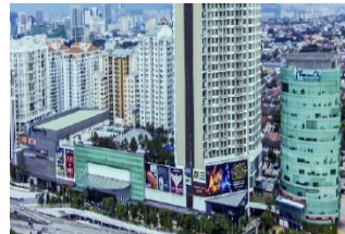
3 Damansara (formerly Tropicana City Mall) & Tropicana City Office Tower, Petaling Jaya