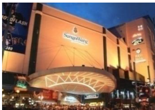
Sungei Wang Plaza Kuala Lumpur