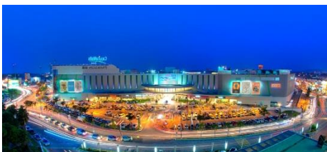
East Coast Mall, Kuantan