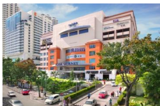
Gurney Plaza, Penang