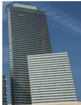
MENARA 3 PETRONAS