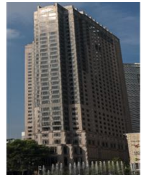
MANDARIN ORIENTAL, KUALA LUMPUR