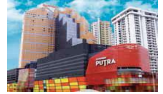
Sunway Putra Mall