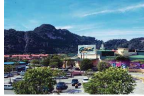
SunCity Ipoh Hypermarket