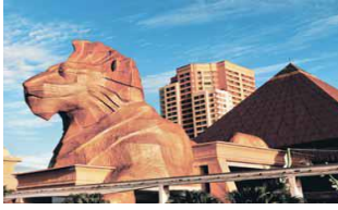
Sunway Pyramid Shopping Mall