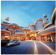
Sunway Resort Hotel