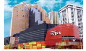
Sunway Putra Mall