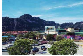
SunCity Ipoh Hypermarket