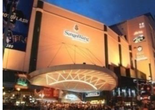
Sungei Wang Plaza Kuala Lumpur