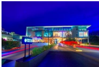
The Mines, Seri Kembangan