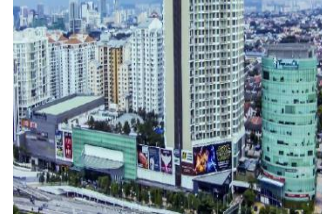
3 Damansara (formerly Tropicana City Mall) & Tropicana City Office Tower, Petaling Jaya