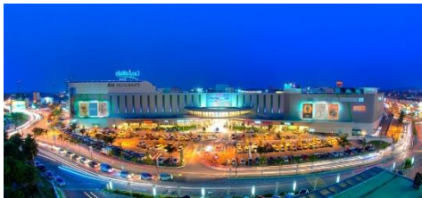
East Coast Mall, Kuantan