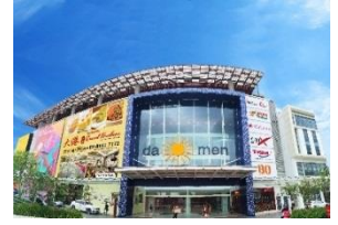
DA MEN Mall