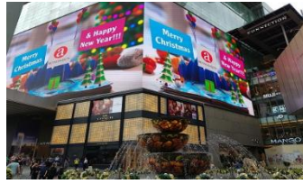
Pavilion Elite Mall