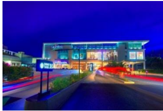
The Mines, Seri Kembangan