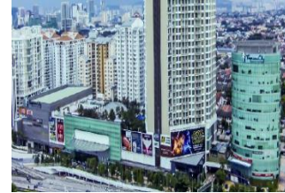
3 Damansara (formerly Tropicana City Mall) & Tropicana City Office Tower, Petaling Jaya