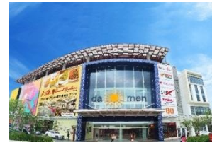
DA MEN Mall