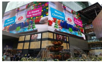
Pavilion Elite Mall