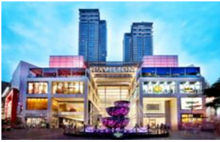
Pavilion Kuala Lumpur Mall