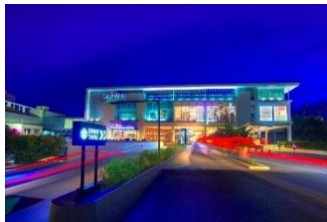
The Mines, Seri Kembangan