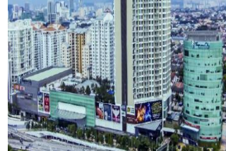
Tropicana City Mall & Tropicana City Office Tower, Petaling Jaya