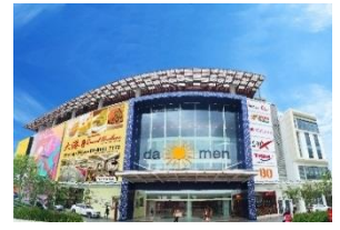
DA MEN Mall