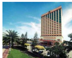
Sunway Hotel Seberang Jaya