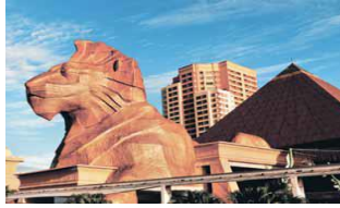
Sunway Pyramid Shopping Mall