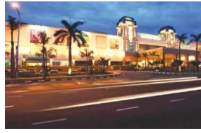
Sunway Carnival Shopping Mall