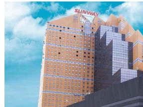
Sunway Putra Tower