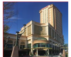
Sunway Clio Property