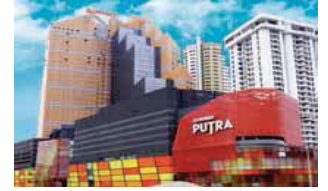
Sunway Putra Mall