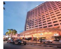
Sunway Hotel Georgetown