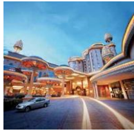
Sunway Resort Hotel