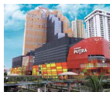
Sunway Putra Hotel