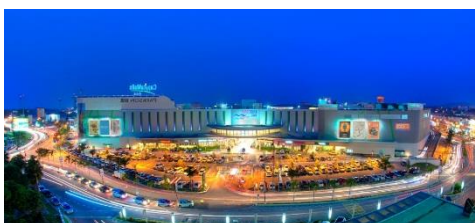
East Coast Mall, Kuantan