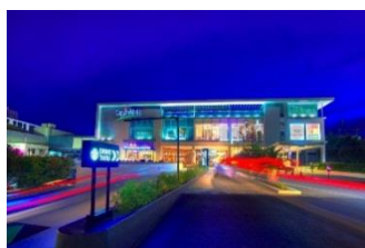
The Mines, Seri Kembangan