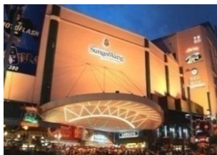
Sungei Wang Plaza Kuala Lumpur