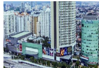
Tropicana City Mall & Tropicana City Office Tower, Petaling Jaya