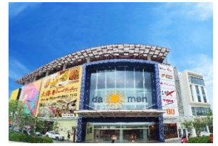
DA MEN Mall