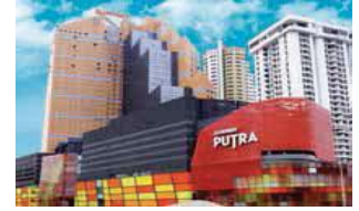
Sunway Putra Mall