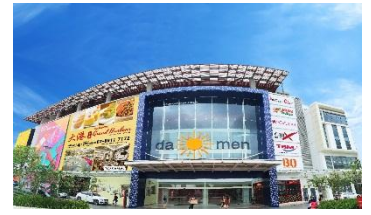
DA MEN Mall