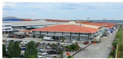
Sunway REIT Industrial – Shah Alam 1