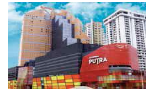
Sunway Putra Mall