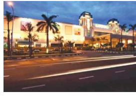
Sunway Carnival Shopping Mall