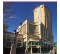
Sunway Clío Property