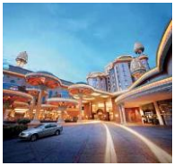
Sunway Resort Hotel