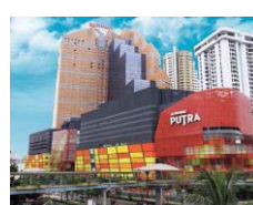
Sunway Putra Hotel