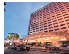
Sunway Hotel Georgetown