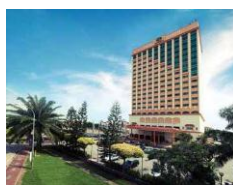
Sunway Hotel Seberang Jaya