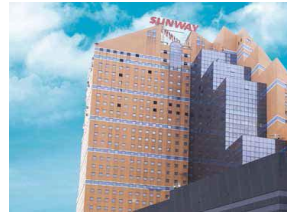
Sunway Putra Tower