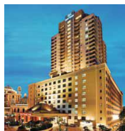
Sunway Pyramid Hotel