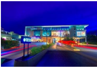
The Mines, Seri Kembangan