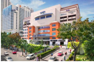
Gurney Plaza, Penang