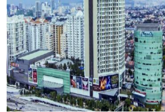
Tropicana City Mall & Tropicana City Office Tower, Petaling Jaya