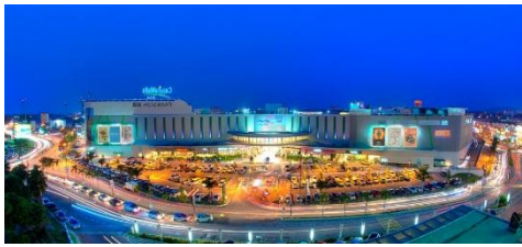
East Coast Mall, Kuantan