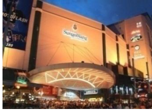
Sungei Wang Plaza Kuala Lumpur