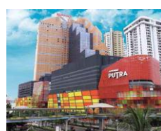
Sunway Putra Hotel