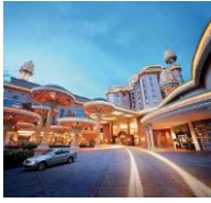
Sunway Resort Hotel