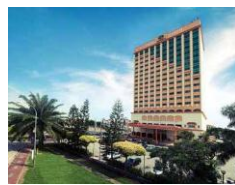
Sunway Hotel Seberang Jaya