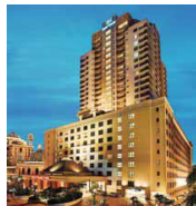
Sunway Pyramid Hotel