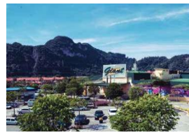
Suncity Ipoh Hypermarket