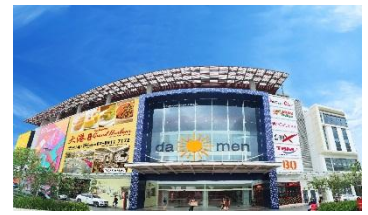
Da Men Mall