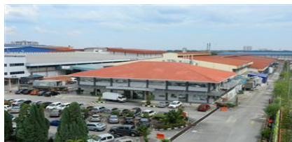
Sunway REIT Industrial – Shah Alam 1