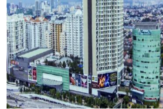
Tropicana City Mall & Tropicana City Office Tower, Petaling Jaya