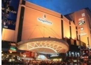
Sungei Wang Plaza Kuala Lumpur