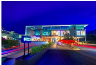
The Mines, Seri Kembangan