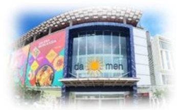
DA MEN Mall