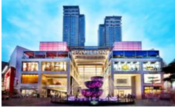
Pavilion Kuala Lumpur Mall