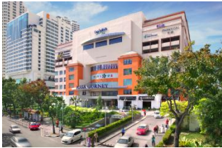
Gurney Plaza, Penang