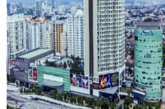
Tropicana City Mall & Tropicana City Office Tower, Petaling Jaya