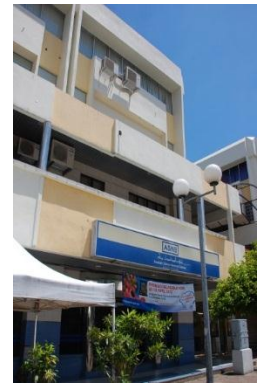
Shop Office Kota Kinabalu