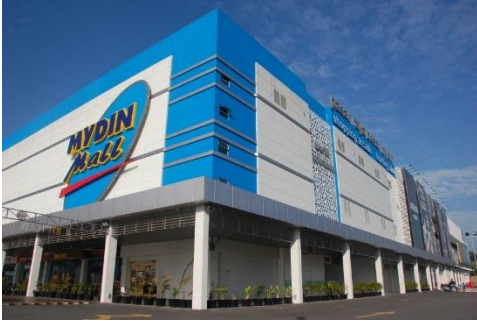
Mydin Mall/Hypermarket, Seremban 2