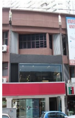
Shop Office Taman Tun Dr Ismail