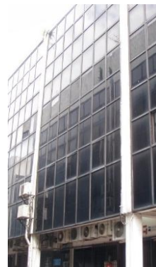
Shop Office Taman Melawati