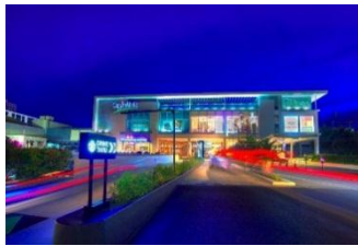
The Mines, Seri Kembangan