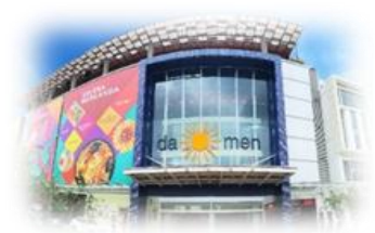
DA MEN Mall