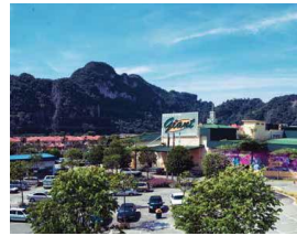
Suncity Ipoh Hypermarket