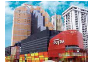
Sunway Putra Mall