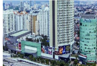
Tropicana City Mall & Tropicana City Office Tower, Petaling Jaya