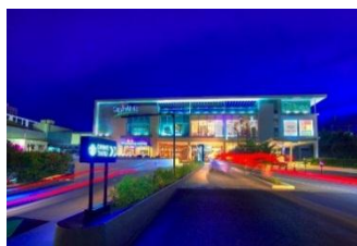
The Mines, Seri Kembangan