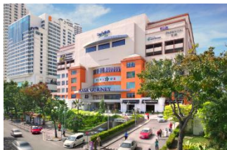
Gurney Plaza, Penang