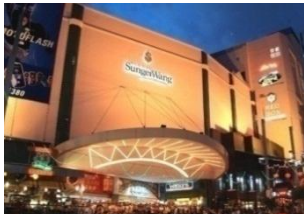
Sungei Wang Plaza Kuala Lumpur