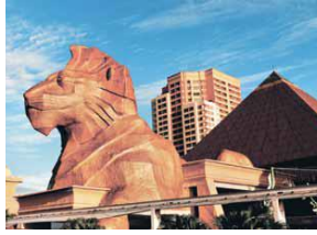
Sunway Pyramid Shopping Mall