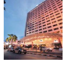
Sunway Hotel Georgetown