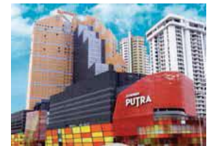
Sunway Putra Mall