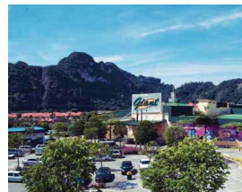
Suncity Ipoh Hypermarket