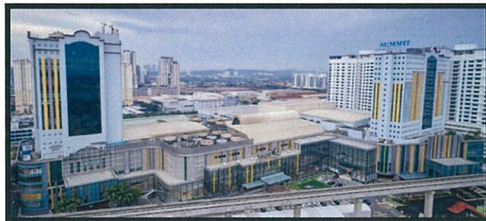
The Summit Subang USJ