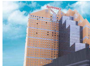
Sunway Putra Tower