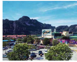
Suncity Ipoh Hypermarket