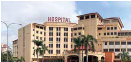
Sunway Medical Centre