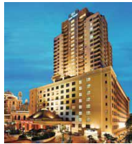
Sunway Pyramid Hotel