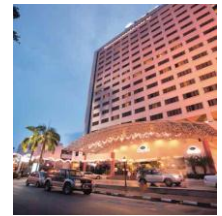
Sunway Hotel Georgetown