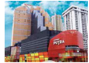
Sunway Putra Mall