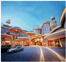
Sunway Resort Hotel & Spa