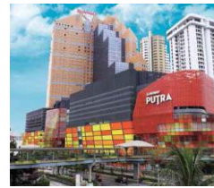
Sunway Putra Hotel