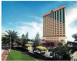
Sunway Hotel Seberang Jaya