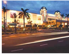
Sunway Carnival Shopping Mall