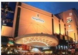
Sungei Wang Plaza Kuala Lumpur