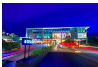
The Mines, Seri Kembangan