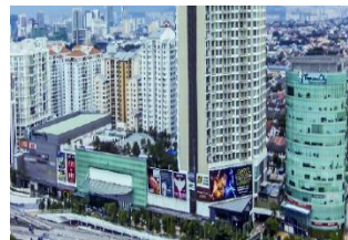
Tropicana City Mall & Tropicana City Office Tower, Petaling Jaya