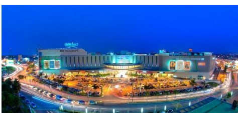
East Coast Mall, Kuantan