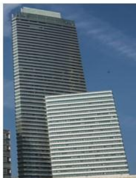
MENARA 3 PETRONAS – RETAIL PODIUM