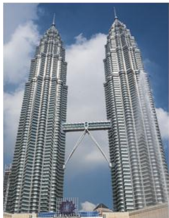
PETRONAS TWIN TOWERS