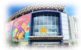
DA MEN Mall