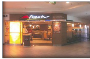
(B) Outlets at Malls