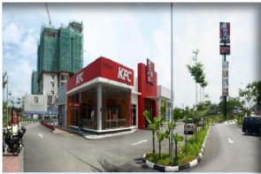
(A) Drive-Through Outlets