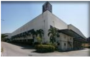
(D) Industrial Premises