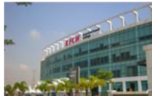
KFCH International College