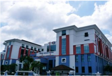
KPJ Perdana Specialist Hospital