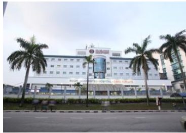
KPJ Selangor Specialist Hospital