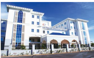
KPJ Penang Specialist Hospital