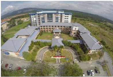
KPJ Healthcare University College