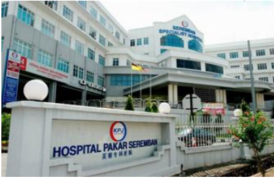
KPJ Seremban Specialist Hospital