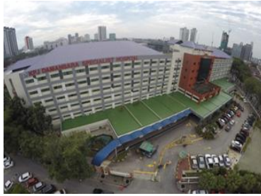
KPJ Damansara Specialist Hospital