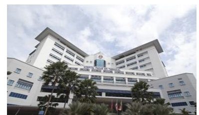
KPJ Tawakkal Specialist Hospital