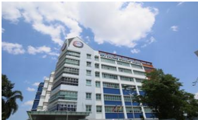
KPJ Kajang Specialist Hospital