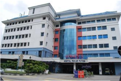
KPJ Puteri Specialist Hospital