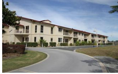
JETA Gardens Aged Care & Retirement Village