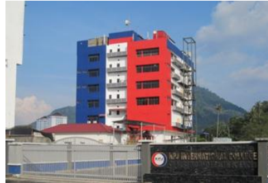
KPJ International College