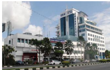
Kedah Medical Centre