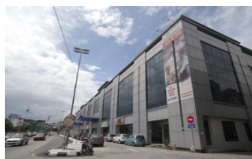
Tawakkal Health Centre