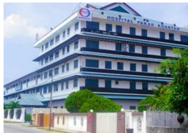
Kuantan Specialist Hospital