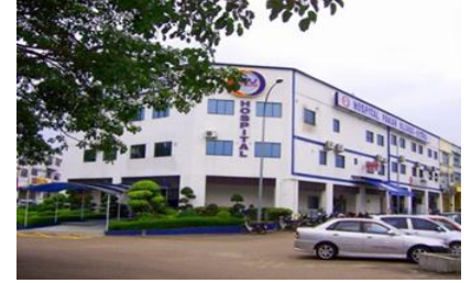
Kluang Utama Specialist Hospital