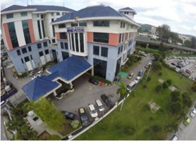
KPJ Ampang Puteri Specialist Hospital