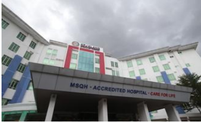
KPJ Klang Specialist Hospital