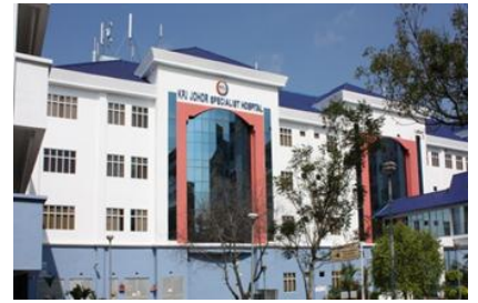
KPJ Johor Specialist Hospitals