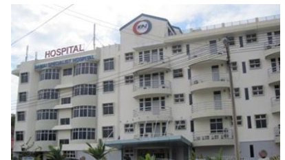
Damai Specialist Hospital