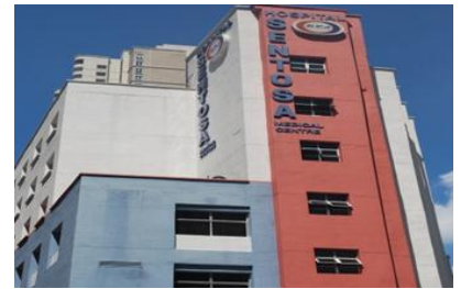
Sentosa Medical Centre