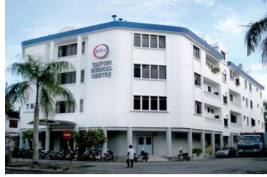
Taping Medical Centre