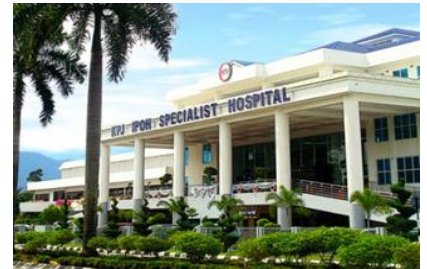
KPJ Ipoh Specialist Hospital