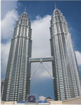
PETRONAS TWIN TOWERS