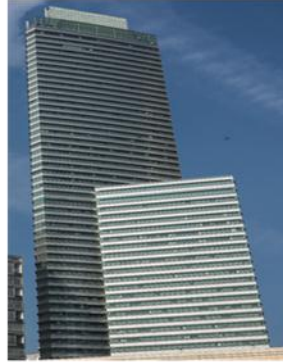
MENARA 3 PETRONAS