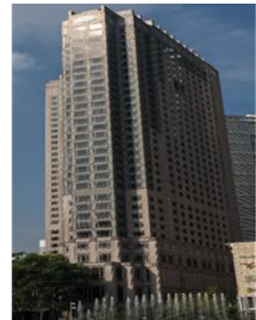
MANDARIN ORIENTAL, KUALA LUMPUR