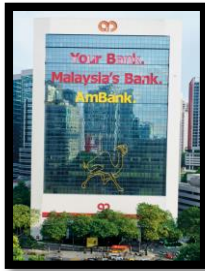
Bangunan AmBank Group