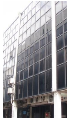
Shop Office Taman Melawati