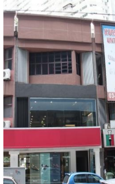
Shop Office Taman Tun Dr Ismail