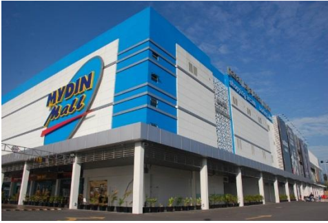
Mydin Mall/Hypermarket, Seremban 2