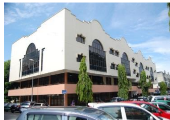
Sri Impian Office Building