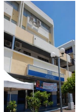
Shop Office Kota Kinabalu