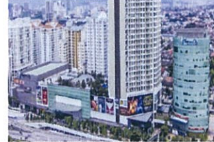
Tropicana City Mall & Tropicana City Office Tower, Petaling Jaya