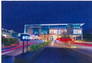
The Mines, Seri Kembangan