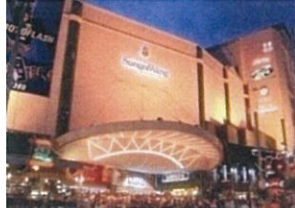
Sungei Wang Plaza, Kuala Lumpur