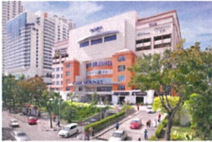
Gurney Plaza, Penang