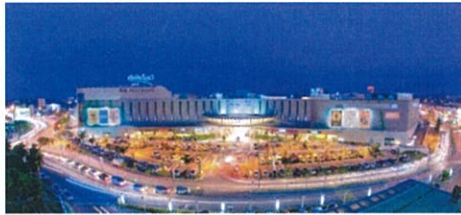
East Coast Mall, Kuantan