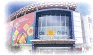
DA MEN Mall