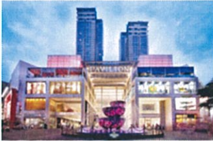
Pavilion Kuala Lumpur Mall